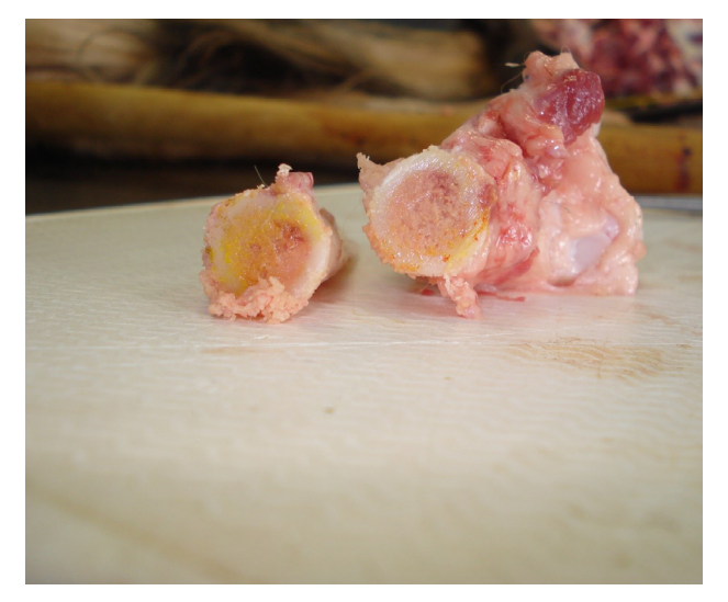
Figure 3. Cross section of femoral epiphyses filled mainly with adipose tissue (white bone marrow replacing the red bone marrow).

According to SOUSA et al. (2010), the clinical manifestations of the subclinical and acute phases may present themselves in a mild or severe form in the chronic phase. Additionally, RODRÍGUEZ-ALARCÓN et al. (2020) reported that cases that evolved to the chronic phase may present pancytopenia