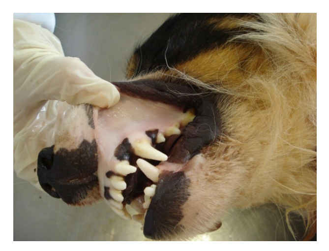
Figure 1. Dog with pale oral mucosa.

Complementary tests were performed, including an antibody detection test (Snap 4Dx Plus - IDEXX), with a positive result for Ehrlichia canis . The complete blood count (CBC) showed a hematocrit of 11% (ref. 37-55%) and a platelet count