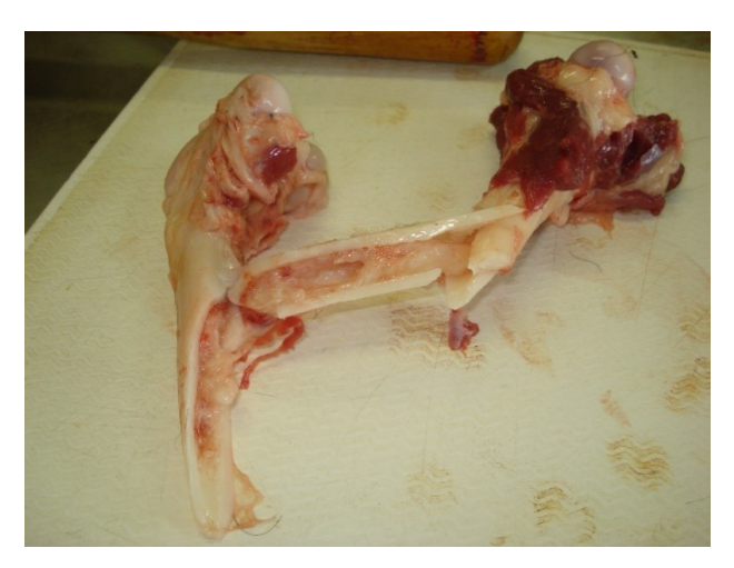
Figure 2. Femur medullary cavity filled with predominantly adipose tissue.

The histopathological findings showed the presence of slightly hypoplastic lymphoid follicles in the spleen, with rare erythrocytic cells in the red pulp, besides a bone marrow formed mainly by unilocular adipose tissue, with small and rare islands of medullary cells (Figure 4), compatible with severe hypoplasia of the red bone marrow and hyperplasia of the white one, non-functional for hematopoiesis. Thus, based on the clinical, laboratory, and pathological findings, we concluded that this was a case of medullary aplasia secondary to ehrlichiosis.