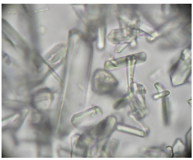
Figure 1. Triple phosphate crystals observed under the microscope, at 400× magnification.

During the experiment, the urea concentration (Table 5) of the confined lambs subjected to diets with different levels of P ranged from 42.70 mg/dL to 90.40 mg/dL, which were above the reference level of 17.12–42.80 mg/dL (KANEKO et al., 2008). There was a difference between the groups at M5 and