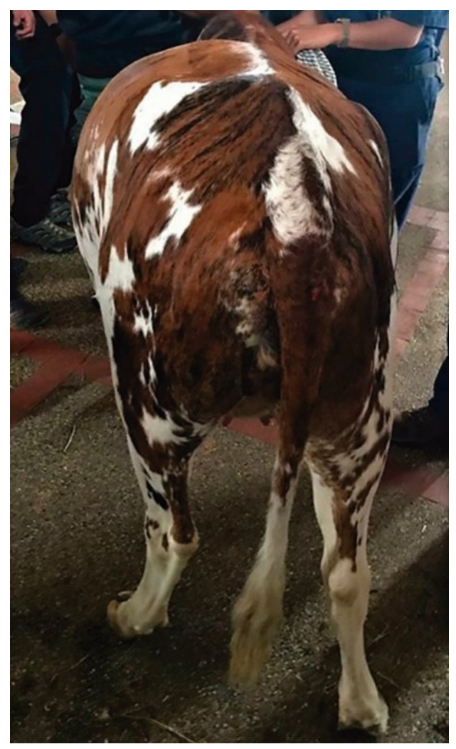
Figure 1. Severe bilateral abdominal distension. The left-sided distension is uniform and extends to the dorsal midline.

At clinical examination the animal showed severe depression, congested mucous membranes with a capillary refill time of 4 seconds, an eyeball sinking of 6 mm, a skinfold return time of 4 seconds, calculated dehydration (>10%), tachycardia (heart rate: 120 beats per minute), a respiratory rate of 22 breaths per minute, a mucopurulent nasal discharge, mixed dyspnea, orthopnea, diffuse crackles in both lungs, coarse crackles in the trachea and respiratory distress. In addition, the heifer had excessive salivation, ventral edema in the head, neck and chest, generalized subcutaneous emphysema that extended by the head, neck and left side (from the scapula to the paralumbar fossa), a marked left abdominal distension associated to a ping sound and ruminal amotility indicative of free-gas bloat (Figure 1). The second cervical third of the esophagus was obstructed at the passage of oro-ruminal probe, and a ruminal trocarization with a 14-gauge x 2-inch needle was performed with gas outlet for 17 minutes.