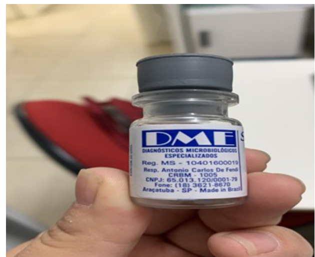
Figure 2. Antibiogram vial used during the examinations.