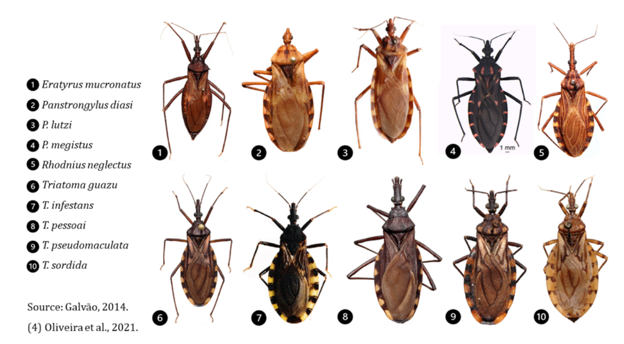
Figure 3. Triatomine species captured in domiciles by the Health Surveillance of the municipality of Barra, Bahia, in the period from 2009 to 2019.

The annual average of triatomines (n=1,091) found in the municipality of Barra is higher than that detected by Melo et al. (2018) in the state of Sergipe, where 838 triatomines were captured in six years of study (average=140). The survey of these insects conducted in the municipality of Aurora, state of Ceará, showed that 1,176 triatomines were captured in four years (average=294) (PINTO et al., 2017). While Barreto et al. (2019) accounted 5,370 triatomines in nine municipalities located in the state of Rio Grande do Norte in the period of five years (average=1,074). These studies were conducted in regions of the Northeast in different periods and methodological conditions from Barra. Therefore, the differences in the annual averages of triatomines captured in these studies are due to several factors, such as: territorial extension of the regions studied; number of endemic disease agents available for vector control in each area; differences in the engagement of the population in the reporting of triatomines; structural and environmental characteristics of both the external environment and domiciles; environmental degradation, altering vegetation and reducing wild animals; and variation in the density of triatomines in each region. Such studies show the