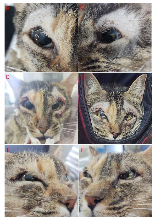
A and B. Pre-operative showing bilateral upper temporal palpebral agenesis, with associated entropion and trichiasis, resulting in excessive tearing; C. Final aspect of the surgical wound (immediate postoperative period) after bilateral Roberts-Bistner blepharoplasty, in the immediate postoperative period; D. Surgical wound 10 days after blepharoplasty; E and F. Final result of correction of eyelid agenesis five weeks after surgery, already with new trichiasis observed in the right and left eyelids.