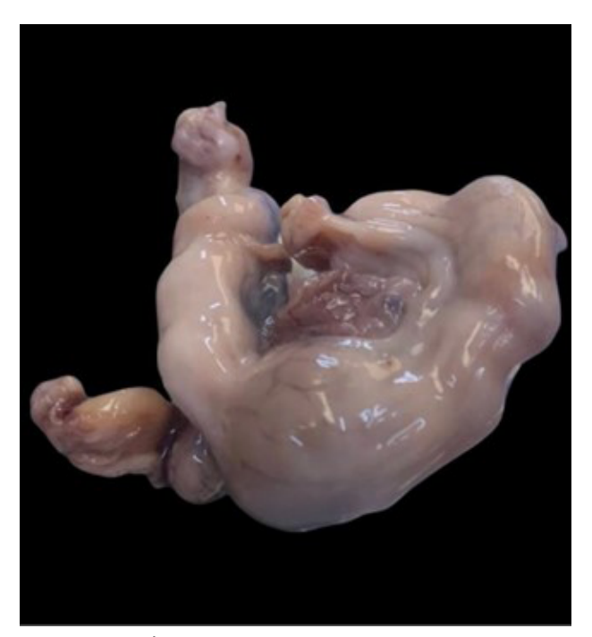
Figure 1. Uterine Horn and Uterine Body Showing a Significant Volume Increase.

As postoperative medication, the patient received tramadol hydrochloride1 [Tramadon®, 2 mg/kg, subcutaneously, every 8 hours for 3 days], dipyrone10 [Novalgina®, 25 mg/kg, orally, every 8 hours for 5 days], and meloxicam9 [Maxicam®,