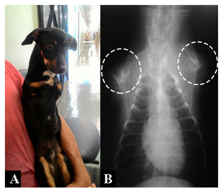
Figure 2. A) Macroscopic observation of transverse terminal humeral bilateral hemimelia after nine months. B) Radiographic observation of bone development in transverse terminal humeral bilateral hemimelia. In the dorsoventral position, it is possible to see humerus proximal ends on the left and right antimeres (circles).

members. The moves observed since then were based in the underpinning of the body weight on the hindlimbs when moving to short distances (about 2 meters), with an intermittent maintenance of the balance. In the next evaluation, the owner reported that the dog's locomotion had improved. During this period, when the animal was six months old, it was castrated. When the animal was one year old, it was detected a better underpinning of the body weight on the hindlimbs during a larger period of time, what allowed it to move through bigger distances. New radiographies were performed so as to observe the skeletal development in view of the deformity. No bone change resulting from hemimelia has been noticed in the adult phase (Figure 2).