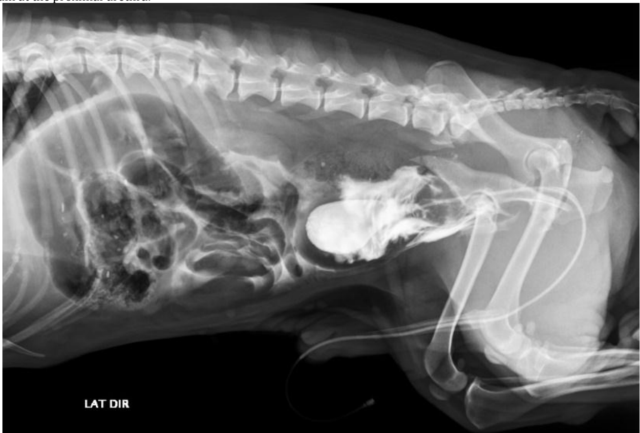
Figure 1 – Cystourethrography with positive contrast showing an apparently intact urinary bladder and leakage of the contrast medium at the proximal urethra.

Positive contrast cystourethrography confirmed a rupture of the lower urinary tract, resulting in leakage of the contrast medium into the abdominal cavity (Figure 1). The urinary bladder was apparently intact because the contrast overflow point was caudal, raising suspicion of urethral rupture. Additional radiography revealed an oblique fracture of the right ilium body, multiple cranial and caudal pubic fractures, two fractures in the ischium body, and bilateral sacroiliac luxation (Figure 2). The iliac body and pubic fragment were found to be significantly moved in the ventral cranial direction and had apparently entered the caudal abdominal cavity.