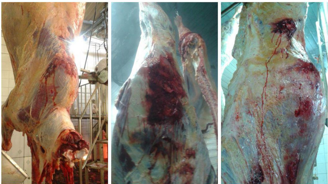
Figure 1 - Bruises in bovine carcasses in Grade I, Grade II and Grade III.