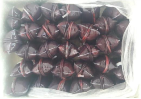
Figure 03. Isothermal box used to store bovine fetal blood collected in a slaughterhouse in São Luís County, Maranhão State.

Bags with BFB are taken to isothermal boxes filled with ice (produced at the slaughterhouse) after blood collection (Figure 03); ice was removed from the box as it started to melt. The price paid for each bag with blood was R$15.00, on average. Based on records of waste dispatch in the slaughterhouse, the bags were traded by a middleman<sup>1</sup> and sent to Imperatriz County, Maranhão State and, from there, to Belo Horizonte City, Minas Gerais State.