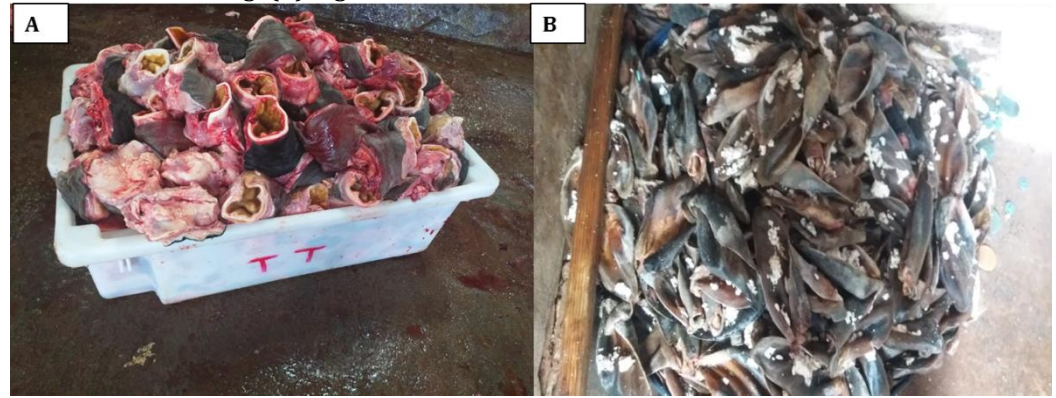
Figure 5. Ear and big ear from beef cattle slaughtered in a slaughterhouse in São Luís County – MA: (A) ear, in natura , stored in plastic boxes before trading; (B) big ear stored in sodium chloride.

The big ear is stored in Coarse-grained NaCl (coarse salt), which corresponds to the dry slag stage. Next, it is kept in covered 500-L plastic water tank, in the room next to the "fataria e triparia" sector for, approximately, eight days (Figure 5B). Finally, it is sold to other salesmen from Paraná State. Both waste types, ear and big ear, are sent for pet feed production, mainly dog feed.