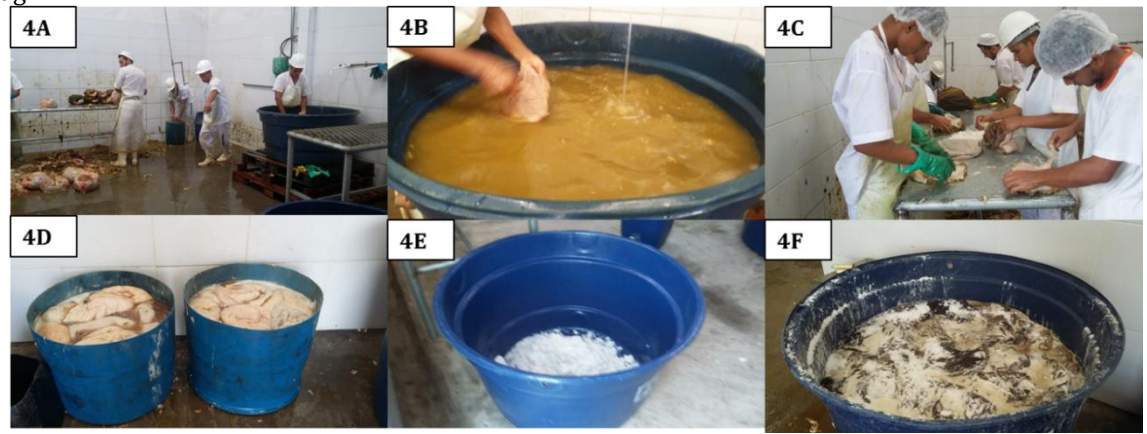
Figure 04. Beef cattle omasum use processing in a slaughterhouse in São Luís County, Maranhão State: (A) Omasum opening and macro residue removal; (B) Omasum washing in chlorine-free water at room temperature; (C) manual removal of membranes coating the omasum; (D) omasum brining; (E) fine-grain sodium chloride in water tank; (F) dry omasum slag.

The life span of omasum salted at the slaughterhouse is 15 days, at most. The price paid for each processed omasum is R$7.00, on average; its trade is carried out by a middleman who negotiates with a Chinese trader (dispatch records). Chinese people use it as ingredient for soup preparation.