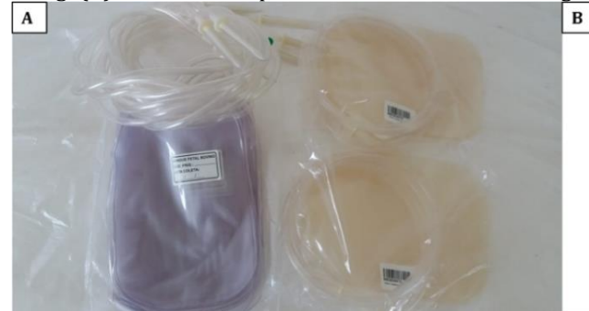
Figure 02. Fetal blood collected in a slaughterhouse in São Luís County, Maranhão State: (A) 500-mL simple model blood collection bag; (B) bovine blood packed in blood collection bags.

Bags with BFB are taken to isothermal boxes filled with ice (produced at the slaughterhouse) after blood collection (Figure 03); ice was removed from the box as it started to melt. The price paid for each bag with blood was R$15.00, on average. Based on records of waste dispatch in the slaughterhouse, the bags were traded by a middleman<sup>1</sup> and sent to Imperatriz County, Maranhão State and, from there, to Belo Horizonte City, Minas Gerais State.