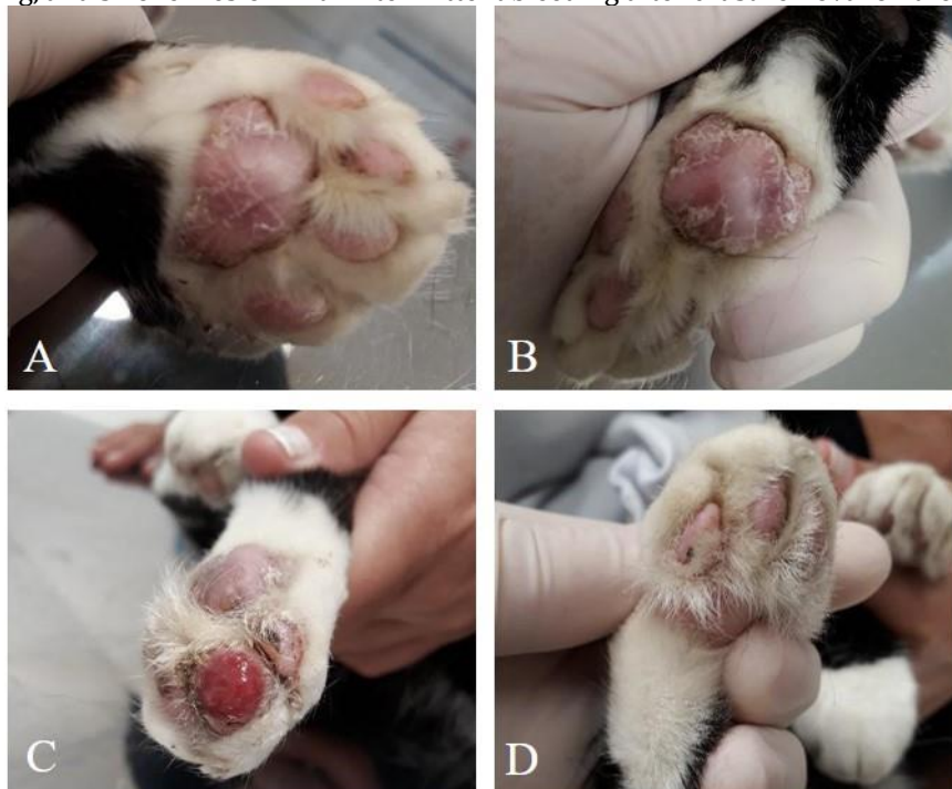
Figure 1. Images of the paw pads lesions of the feline patient: left forelimb (A), right forelimb (B), left hindlimb (C), right hindlimb (D). Thin skin, erythema, scaling, and white striation were noticed on all paw pads of the left fore and hind limbs; and erythematous, oozing, and swollen lesion with intermittent bleeding after crust removal on the left hindlimb.

Slight improvement of the paw pads lesions was noticed after seven days; however, intermittent bleeding was still present on the left hindlimb. There was a decrease in the amount of ocular discharge, and differently from inguinal lymph nodes, popliteal lymph nodes remained enlarged. Results from the cytological analysis revealed a