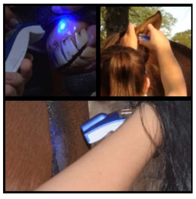
A. Oral mucosa. B. Ear pin. C. Vaginal mucosa (female). Figure 1. Equine temperature measurement using an infrared thermometer (G-TECH®) at three different measurement points.

It was observed that there was no difference between the temperatures obtained with the mercury thermometer and the infrared